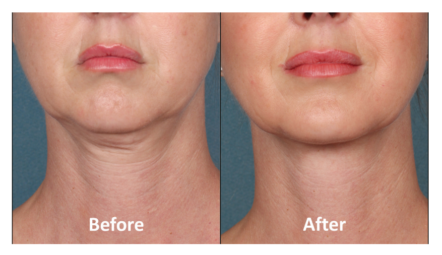
Below: Kybella treatment, age 35, four treatment sessions. After photo - 12 weeks after last session